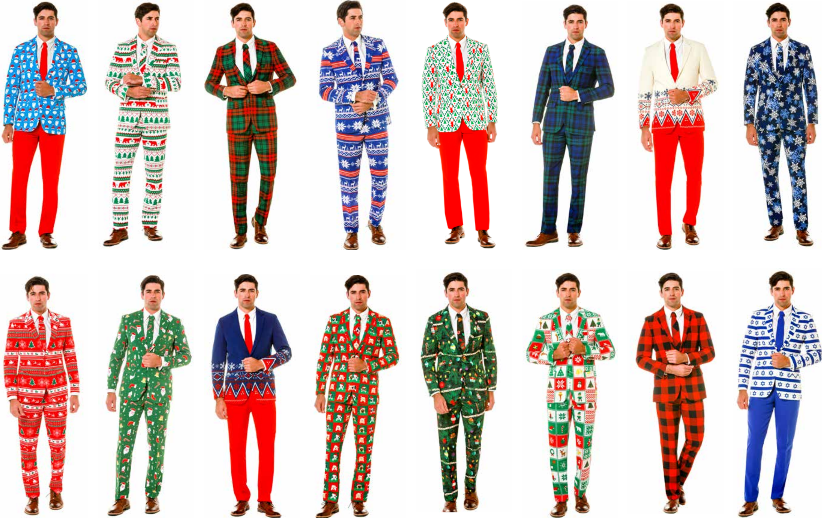
1 OG Reindeer 2 Christmas Tree Camo 3 Blue & Green Plaid 4 Touch Me Twice 5 Creamy Nordic 6 Lumberjack Plaid 7 Snowflakes 8 Rock Star of David 9 OG Reindeer 10 Christmas Tree Camo 11 Blue & Green Plaid 12 Touch Me Twice 13 Creamy Nordic 14 Lumberjack Plaid 15 Snowflakes 16 Rock Star of David