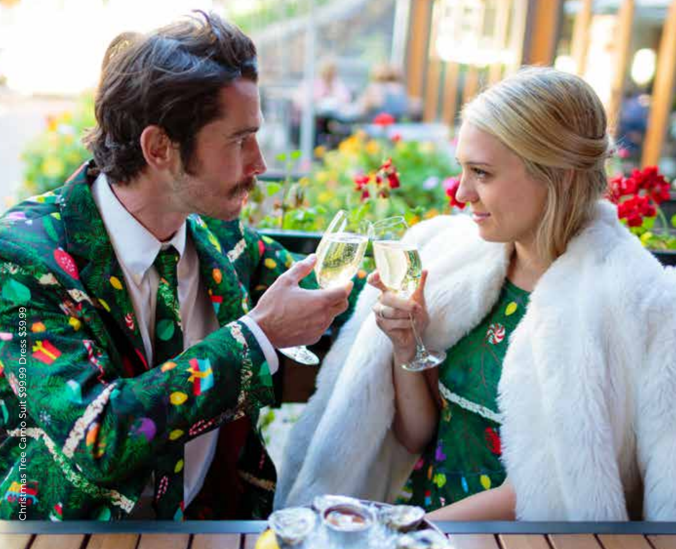
Christmas Tree Camo Suit $99.99 Dress $39.99