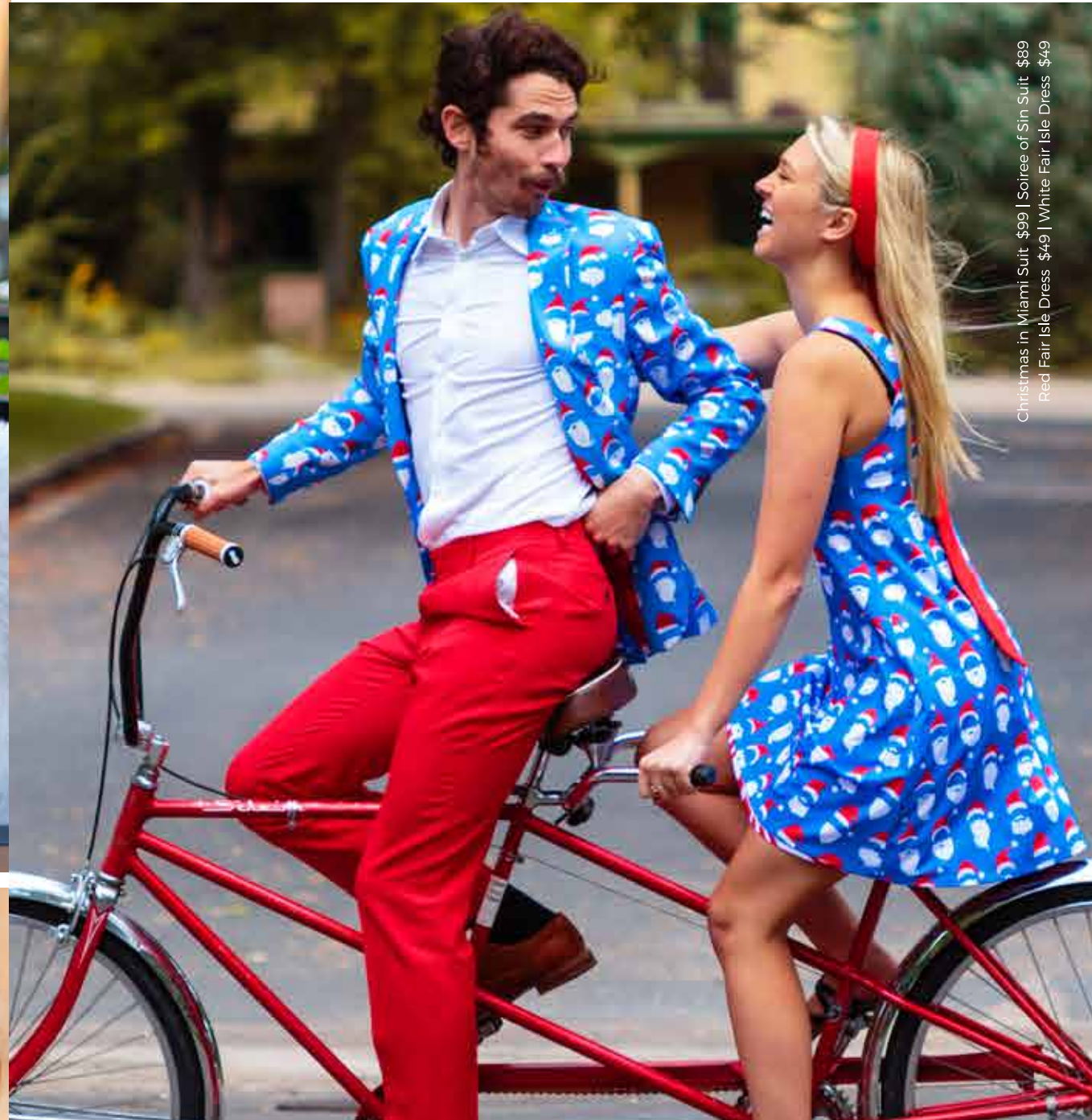
Christmas in Miami Suit $99 | Soiree of Sin Suit $89 Red Fair Isle Dress $49 | White Fair Isle Dress $49